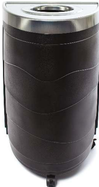
*Shown with the Optional Wheel Caster Kit