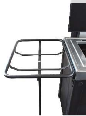
LUNCH TRAY KIT