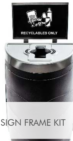
SIGN FRAME KIT