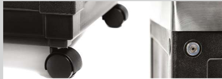
WHEEL CASTER KIT